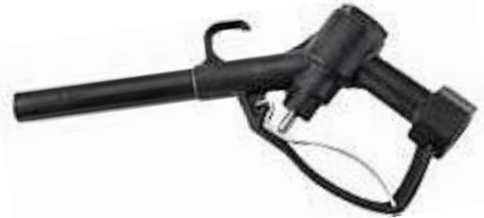
DM-95HFR Series Polypropylene Nozzle